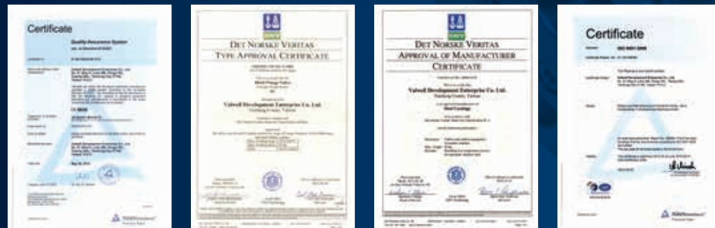
CE Certificate Module H