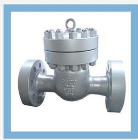
Pressure Seal Swing Check Valve

We are efficiently engrossed in manufacturing, exporting and supplying an exquisite gamut of Pressure Seal Valve . The offered valve is manufactured with quality approved raw material under the strict supervision of expert professional, possessing decades of knowledge in their concerned domain.