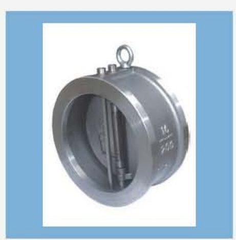
Dual Plate Check Valve