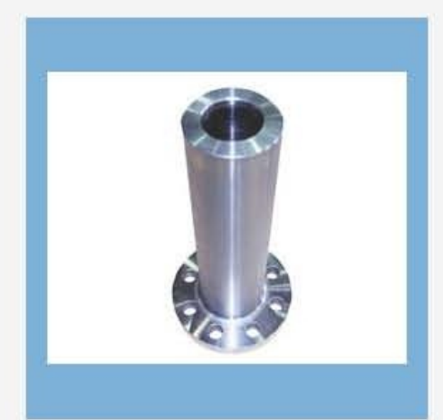
Welded on Flange Forged Steel Valve