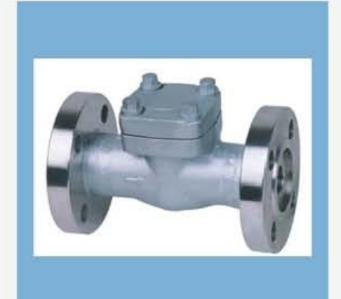
Forged Steel Lift Check Valve