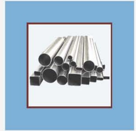
Ferrous and Non-Ferrous Industrial Tube