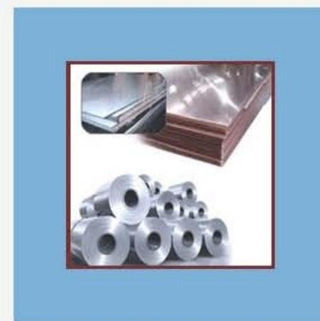
Metal Sheet & Plate