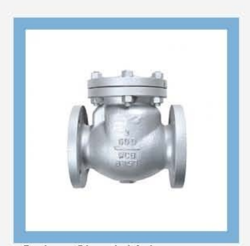
Swing Check Valve