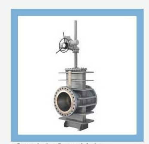
Conduit Gate Valve