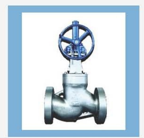
Pressure Seal Globe Valve