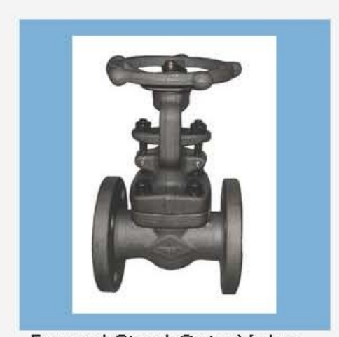
Forged Steel Gate Valve