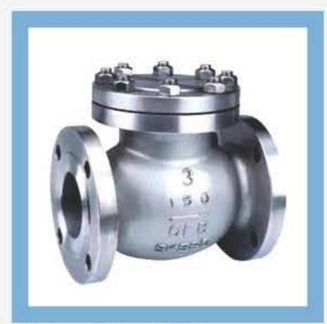
Swing Check Valve

Under the supervision of our skilled professionals, we are efficiently engrossed in supplying an exclusive spectrum of Swing Check Valve . The offered valve remains in great demand across the world for its varied characteristics such as unbeatable quality and long life.