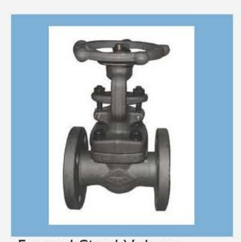
Forged Steel Valves