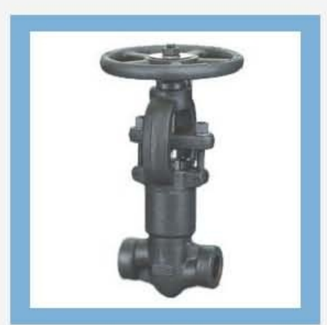
Welded Bonnet Forged Steel Valve