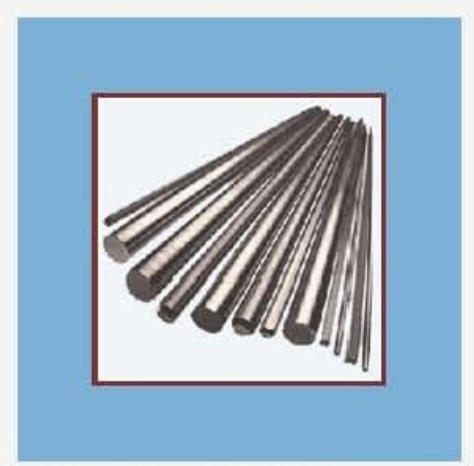
Stainless Steel Bar