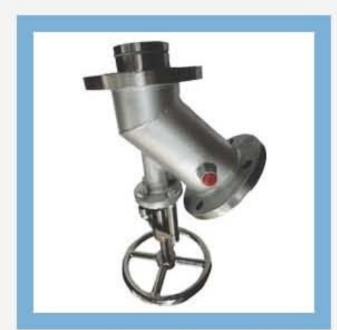
Flush Bottom Valve