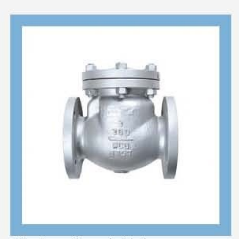
Swing Check Valve