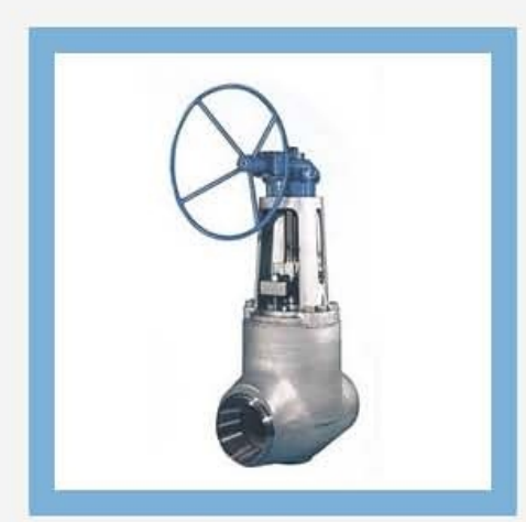
Pressure Seal Gate Valve